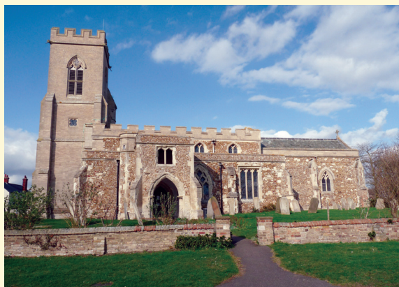
St. Mary Magdalene, Dunton: Tower repairs