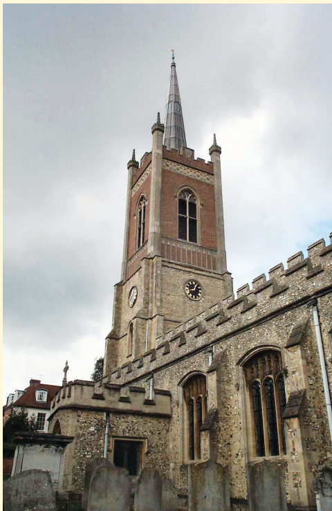
St. Michael, Bishop's Stortford: Belltower access