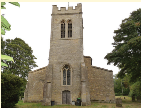
St. Mary Magdalene, Melchbourne: Tower repairs