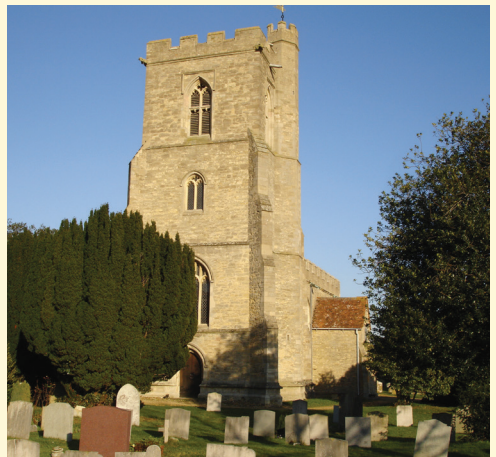
St. Owen, Brombam: North side extension