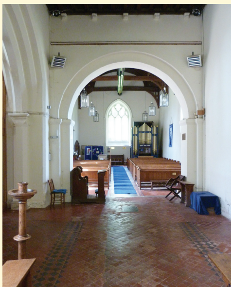
St. Mary, Pirton: Tower masonry repairs

All income and expenditure derives from continuing activities.