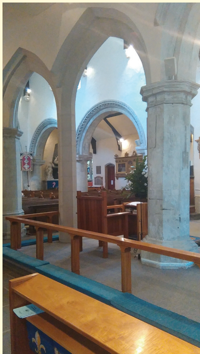
St. Lawrence, Abbots Langley: Fabric repairs