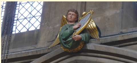
St. Paul, Bedford: Burst water main