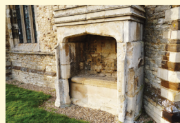
All Saints, Houghton Conquest