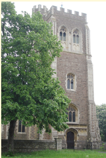
St. Mary, Cardington: Floor and masonry repairs