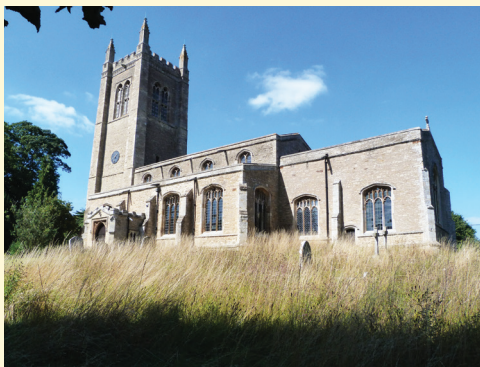
All Saints, Odell: External stonework repairs