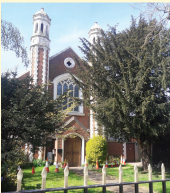
Baldock Methodist Church: External repairs