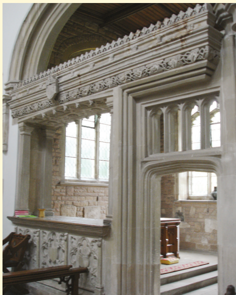
St. Mary, Cardington: Floor and masonry repairs