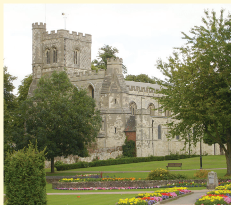
Dunstable Priory Church: Roof repairs