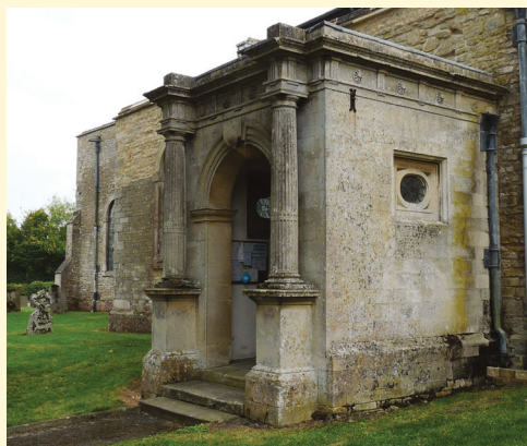
St. Mary Magdalene, Melchbourne: Tower Repairs