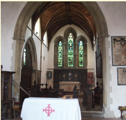
St. Peter Arkley: Heating repairs