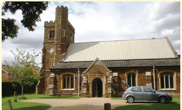
St. Mary, Clophill: Roof and gutter repairs