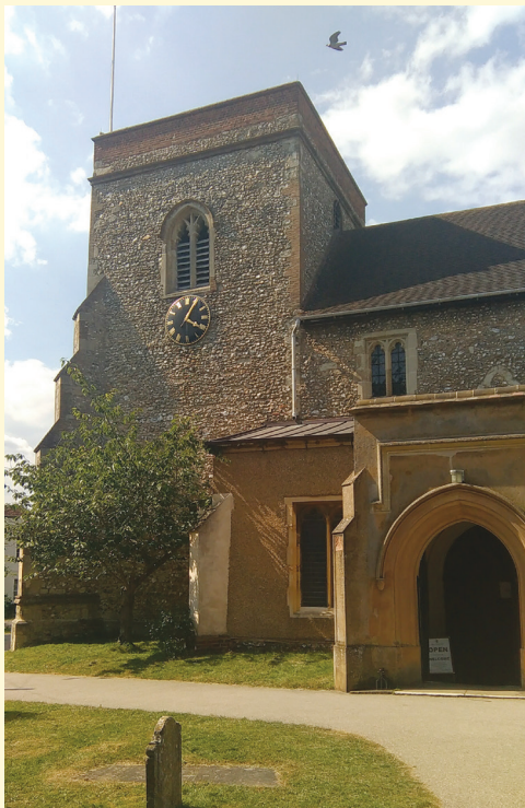
St. Lawrence, Abbots Langley: Fabric repairs