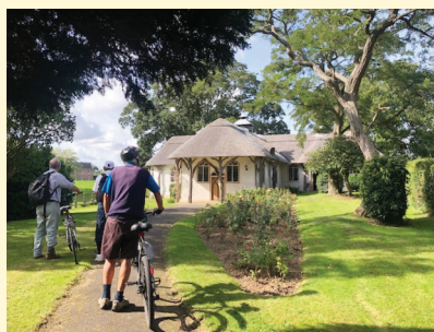
Bike Ride at Rixton URC