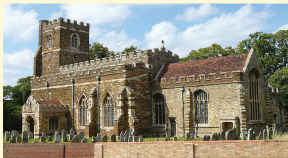
All Saints, Houghton Conquest: Roof repairs