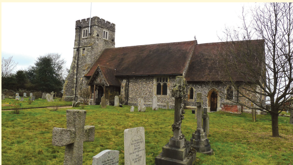
St. Margaret, Ridge: QI works

Thundridge, St. Mary Tingrith, St. Nicholas Toddington, St. George of England Totteridge, St. Andrew Totternhoe, St. Giles Tring, Akeman Street Baptist Church Tring, New Mill Baptist Church Tring Team Ministry Turvey, All Saints Upper Caldecote Methodist Church Walkern & Sandon URC Walkern, St. Mary the Virgin Wallington, St. Mary Ware, Leaside Church Ware, Christ Church Watford, Holy Rood Watford Quaker Meeting Watford, St. Andrew Watford, St. Michael and All Angels Watford, St. Peter Watton-at-Stone, St. Andrew & St. Mary Westmill, St. Mary the Virgin Weston, Holy Trinity Westoning, St. Mary Magdalene Wheathampstead URC Wheathampstead, St. Helen Whipsnade, St. Mary Magdalene Widford, St. John the Baptist Wigginton, St. Bartholomew Wilden, St. Nicholas Willian, All Saints Willington Methodist Church Willington, St. Lawrence Wilshamstead, All Saints Wilstone, St. Cross Woburn Sands, St. Michael Woolmer Green, St. Michael Wootton, St. Mary the Virgin Wrestlingworth, St. Peter Wymington, St. Lawrence Yelden, St. Mary