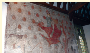
St. Margaret, Ridge: QI works