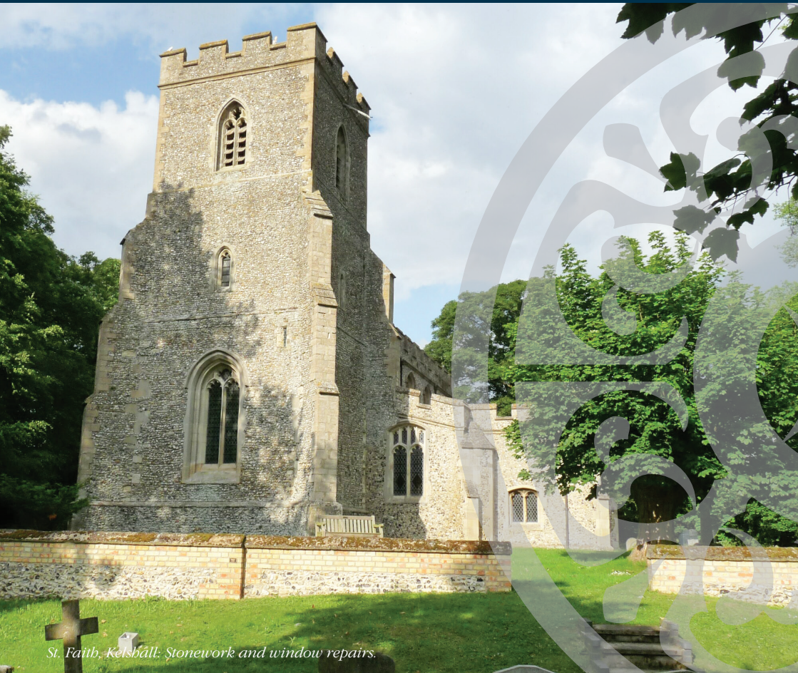
St. Faith, Kelshall: Stonework and window repairs.