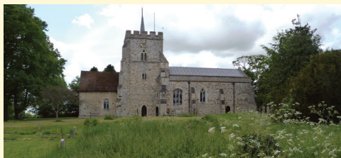
St. Mary, Pirton: Tower masonry repairs