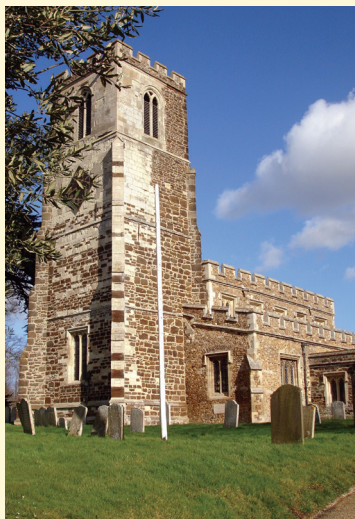
All Saints, Sutton: Electrical repairs