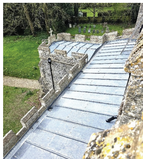
Before and after: The weatherproofed scaffolding helped speed up the job, and the finished project with new gutters and roof.