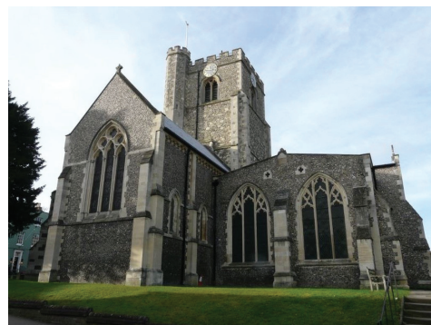
St Peter's Berkhamsted topped the fundraising chart with £3,786.

Get ready for Bike 'n Hike 2026 on Saturday 12 September.