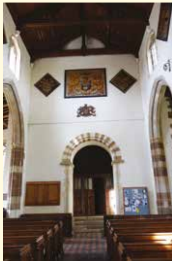
St. Edmund or St. James, Blunbam: Kitchen and toilet