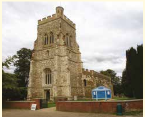
St. Mary, Henlow: French drains