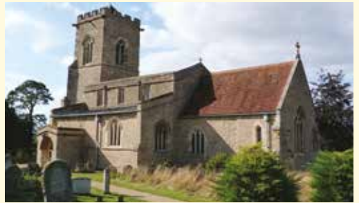
St. Mary, Carlton: French drains