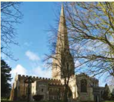
All Saints, Leighton Buzzard: Evensong July 2019