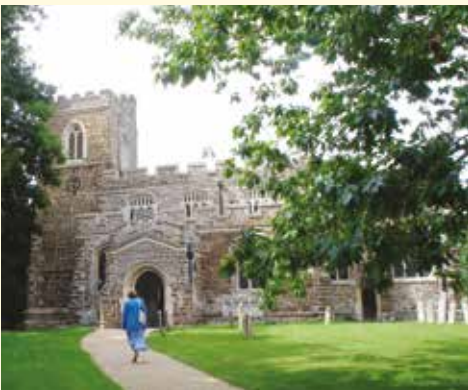
St. Nicholas, Tingritb: Masonry Repairs