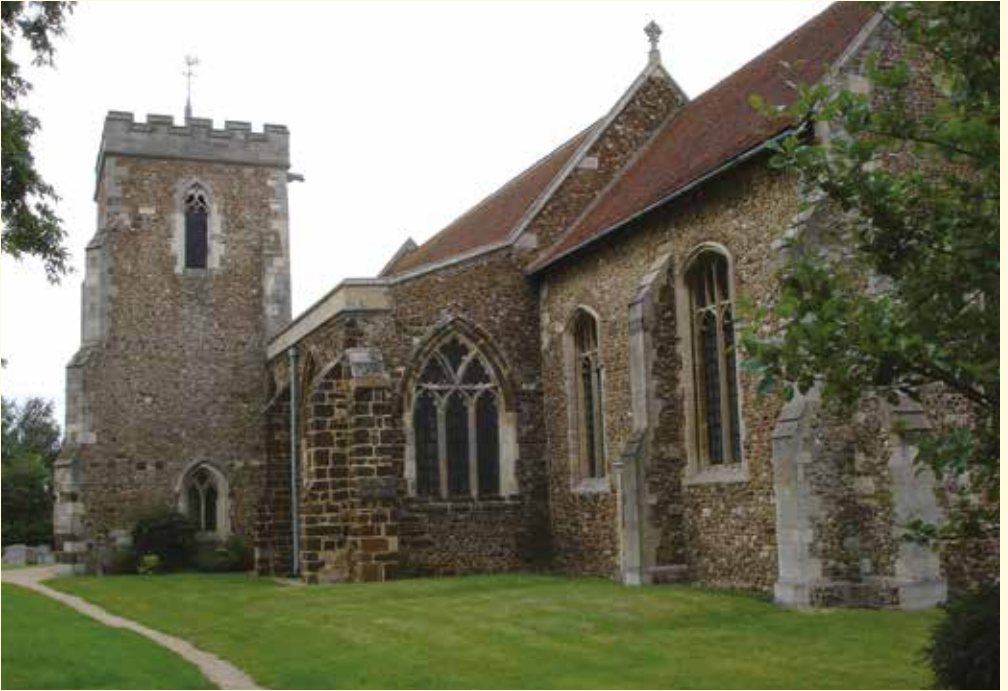
St. Andrew, Langford: Re-ordering West End