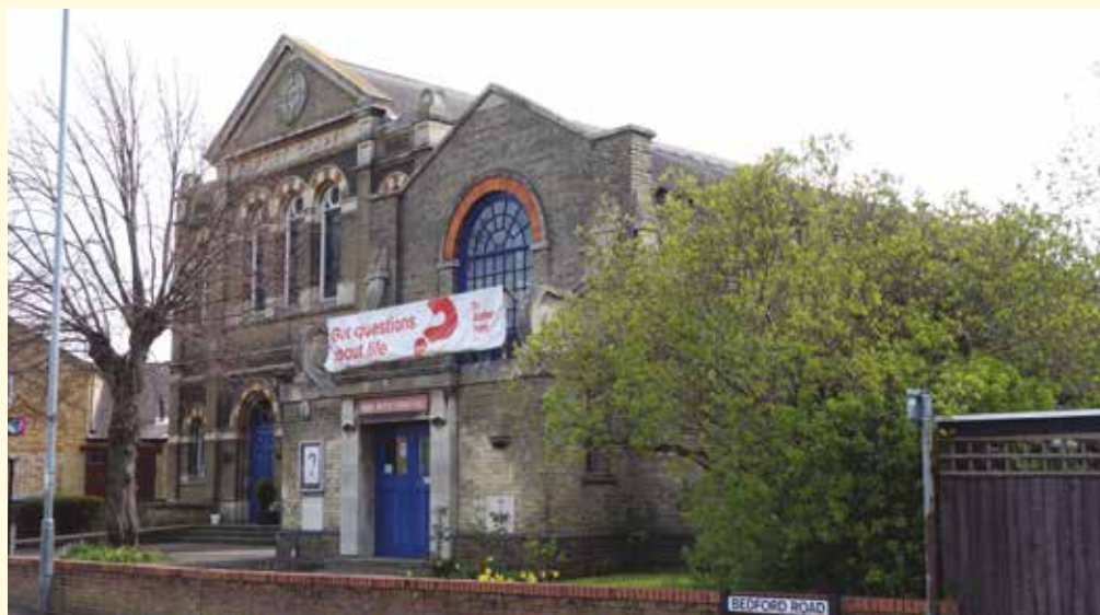
Sandy Baptist Church: Disabled Access