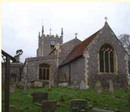
St. Mary Magdalene, Barkway: Fabric Repairs