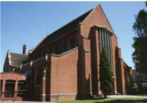
All Saints, Bedford Queens' Park: Heating Repairs