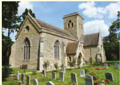
St. Mary, Bletsoe: Chancel Restoration