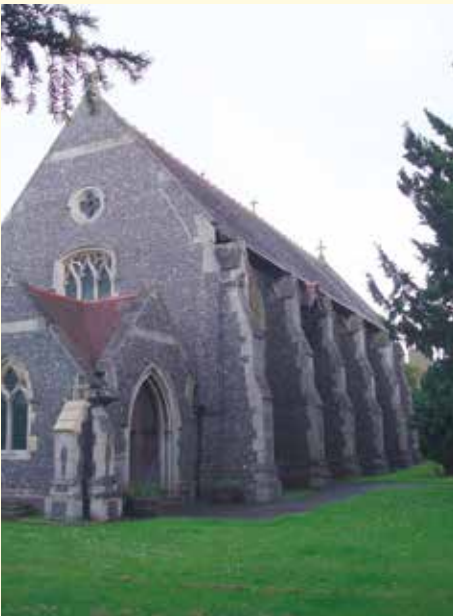
Al Saints, Long Marston: Drainage & Stonework Repairs