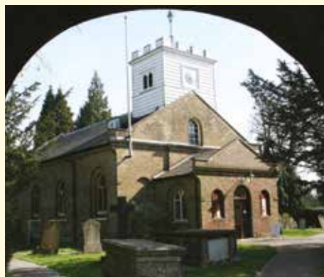
St. Andrew's Totteridge: Tower Repairs