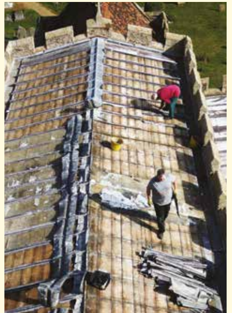
All Saints, Houghton Conquest: Roof Repairs