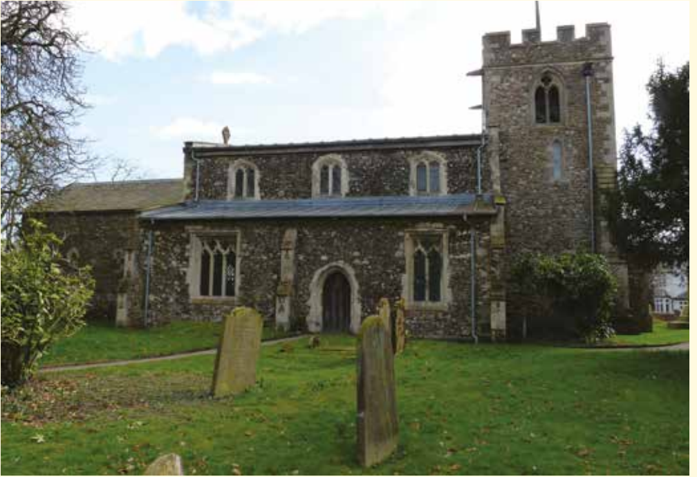
St. Peter, Wrestlingworth: Roof Repairs