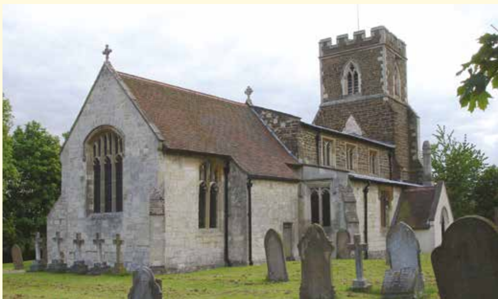
St. John, Stanbridge: North Aisle Roof Repairs

All income and expenditure derives from continuing activities.