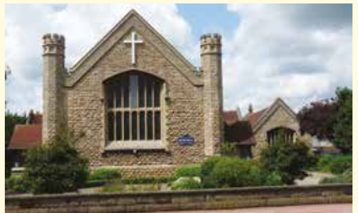
Kempston East Methodist Church: Heating Repairs