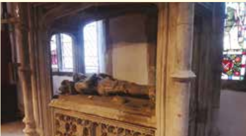
St. Giles, South Mymms: Floor Repairs