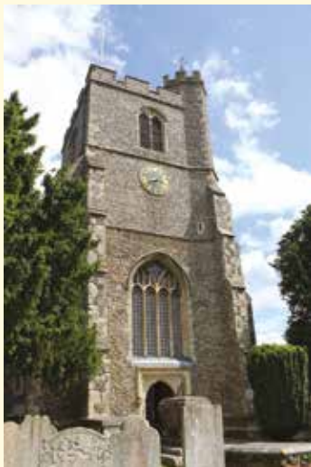
St. Augustine, Broxbourne: Window Repairs